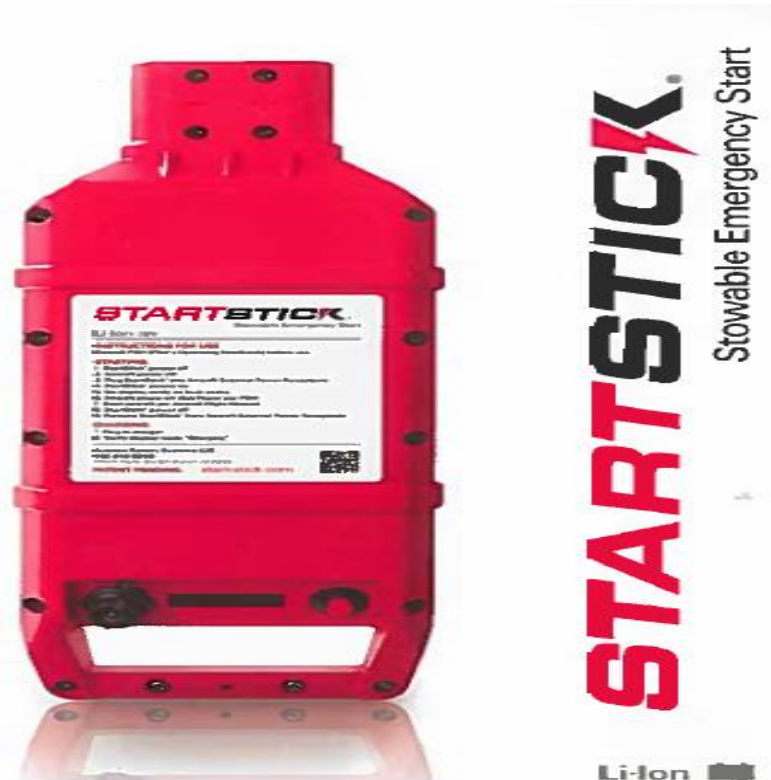
Example of Portable GPU